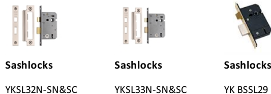
Sashlocks YKSL32N-SN&SC Sashlocks YKSL33N-SN&SC Sashlocks YK BSSL29