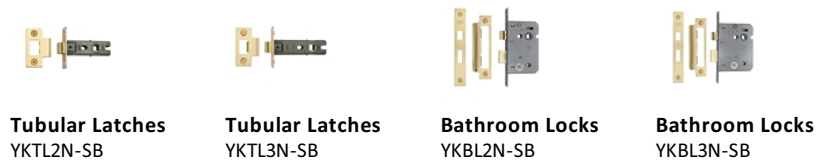
Tubular Latches YKTL2N-SB