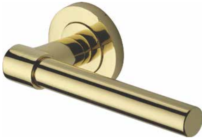
1 ITEM VIEW